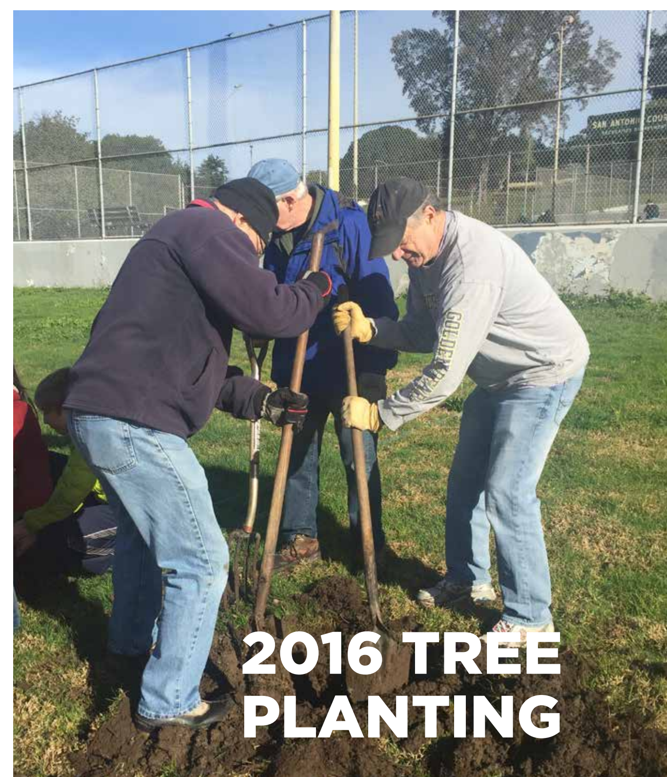
2016 TREE PLANTING

GOAL: formal multi-year agreement between Friends of San Antonio Park and the City of Oakland to establish and implement Park stewardship standards, roles, and accountability to promote maximum participation.