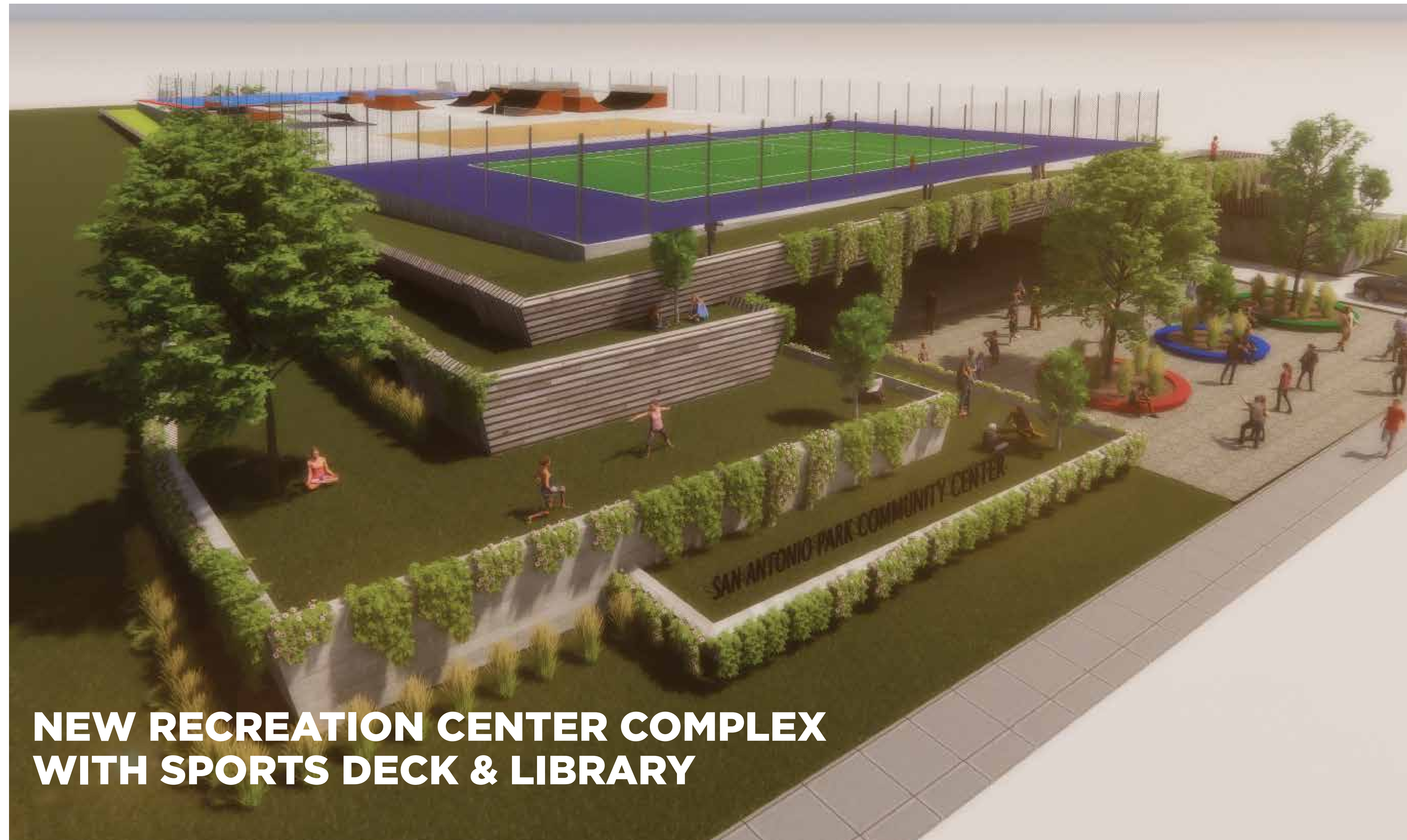
NEW RECREATION CENTER COMPLEX WITH SPORTS DECK & LIBRARY

Our vision for a full-service COMMUNITY CENTER