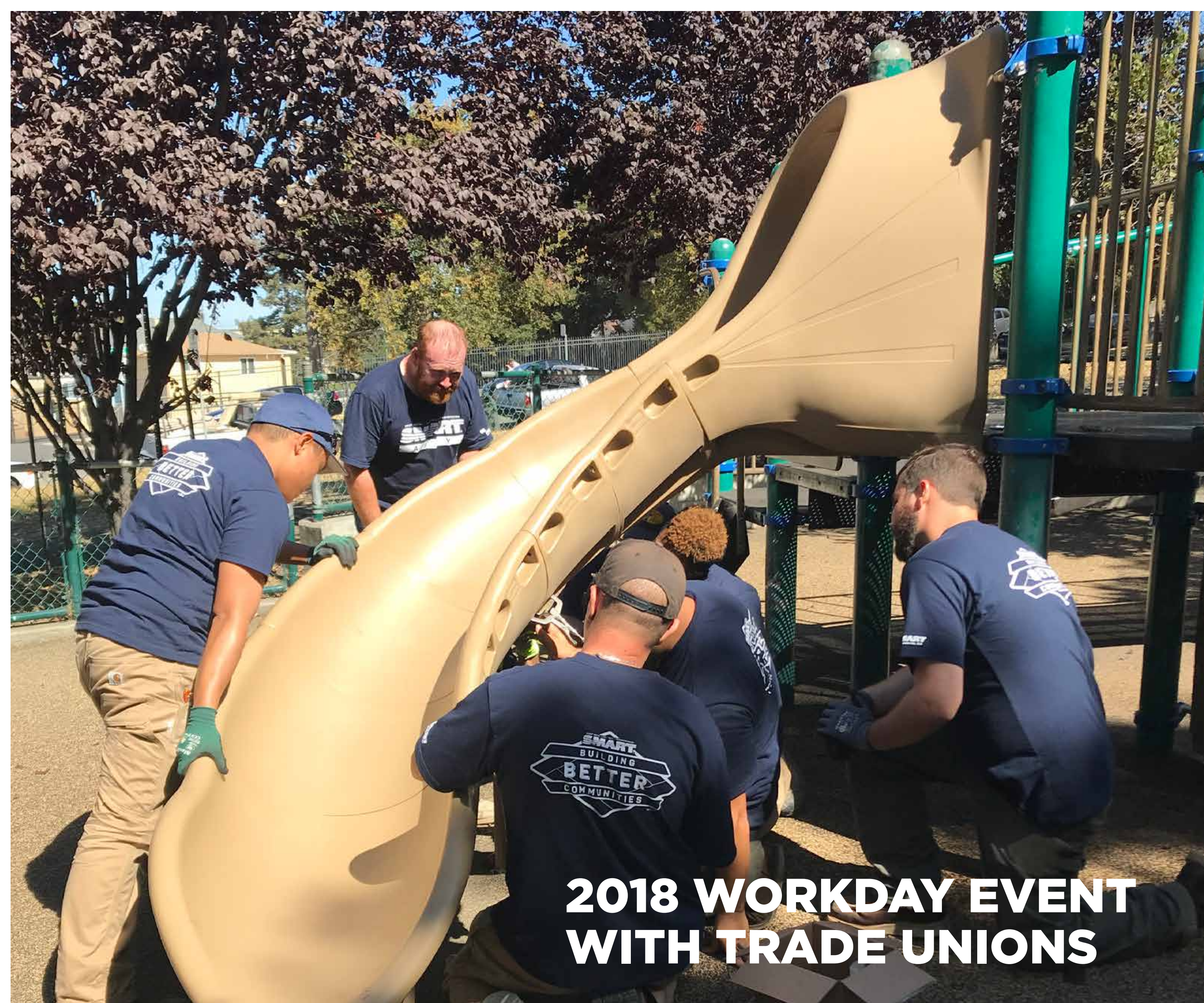
2018 WORKDAY EVENT WITH TRADE UNIONS